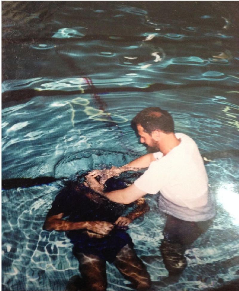
Picture of a baptism at the YMCA