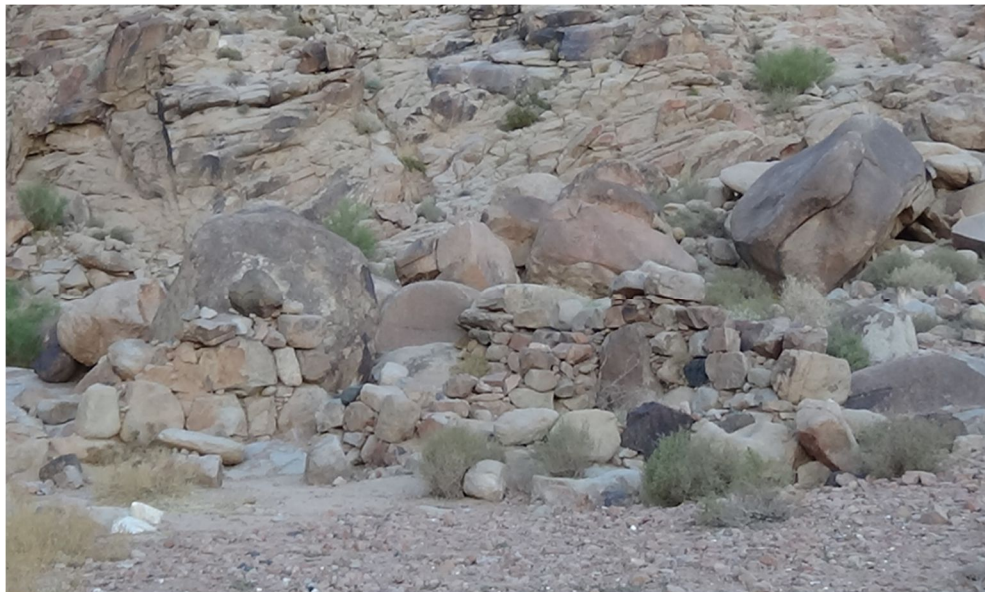
The Altar Moses built from Exodus 24:4 below Mount Sinai

Going to Saudi Arabia and seeing the real Mount Sinai has built my faith tremendously. To see the mountain, the golden calf altar, and even the fire pits where the gold for the golden calf was made was so powerful.