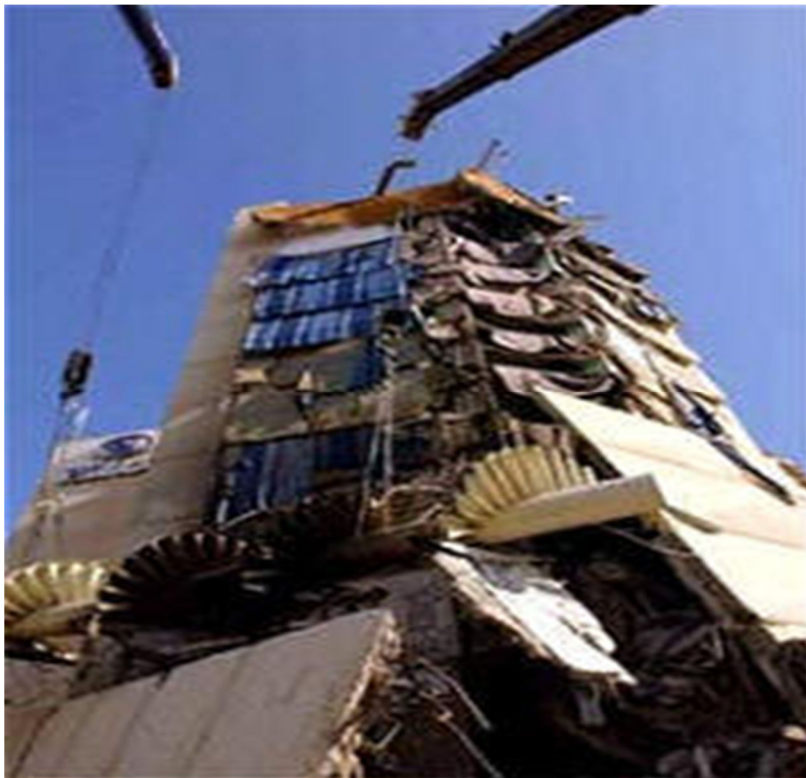
Bombing of Hilton Hotel in Sinai Egypt

It was only after everything was over that I truly grasped the concept that Yahweh is always in control, and true faith is always trusting in Yahweh's answer whether it is yes or no.