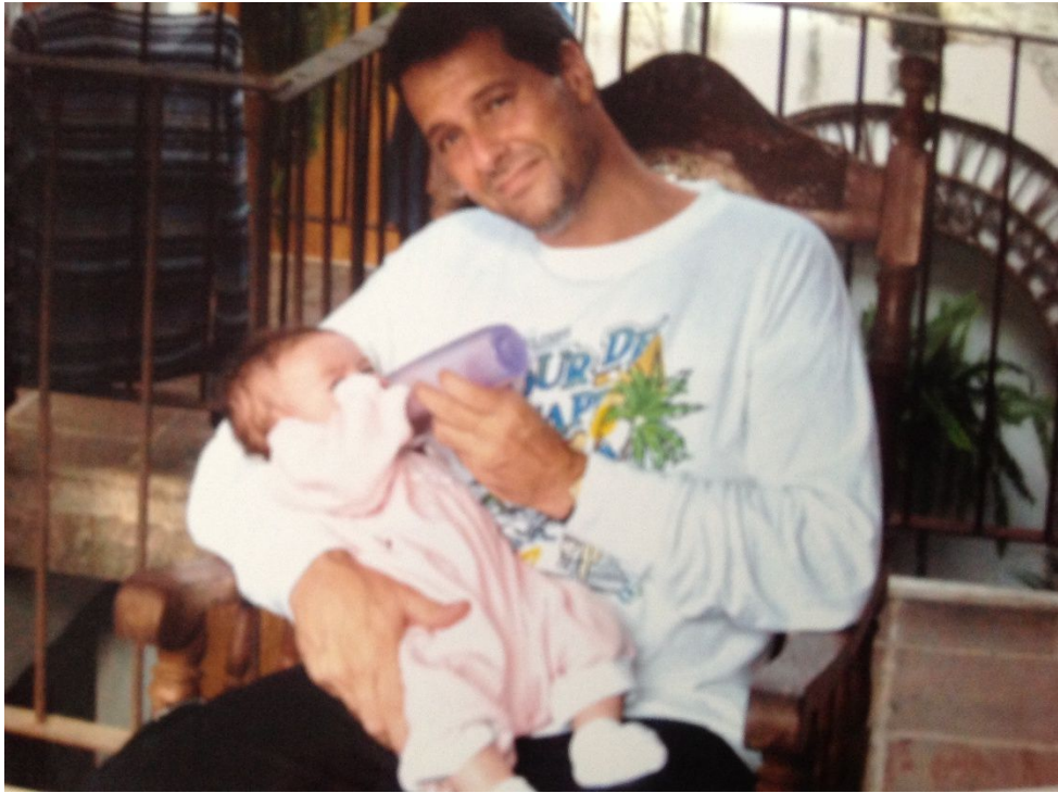
Picture of me feeding Moriyah during the adoption process in Central America.