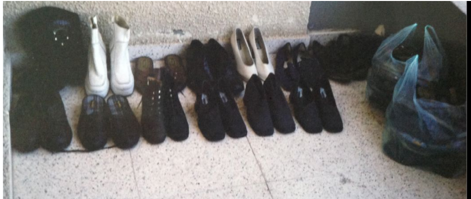
Picture of brand-new shoes we found to give to the family in Israel

Sometimes we are not receiving from Yahweh because we are not asking in faith. If we are seeking His will first in everything, He will provide all our needs and more. But we must believe!